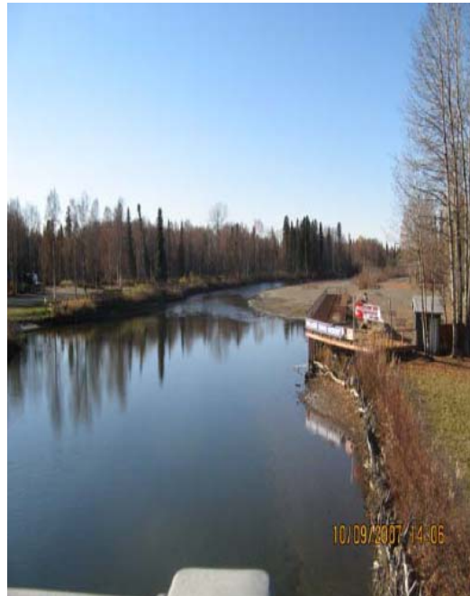
Photo 2: Elevated walkway and root wads installed along right bank Willow Creek downstream of Park's Highway Bridge; Willow Creek Lodge is out of photo to the right of project; photo courtesy of Russ Miller, 2007.