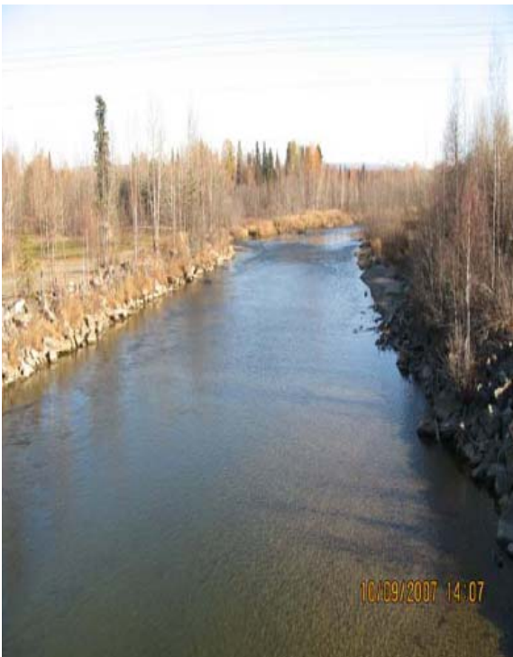
Photo 3: Willow Creek upstream of Parks Highway Bridge; photo courtesy of Russ Miller, 2007.